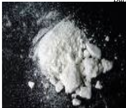
This substance above is only a